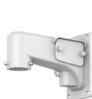
WALL BRACKET IR-V-BKP-WAL-01