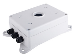
JUNCTION BOX IR-V-BKP-JBW-01