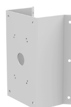
CORNER MOUNT IR-V-BKP-CNR-01