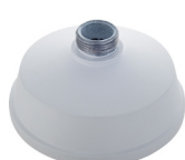
PENDANT CAP IR-V-BKT-ADT-02