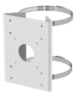
POLE MOUNT IR-V-BKP-POL-01