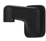
WALL MOUNT IR-V-BKX-WAL-01B