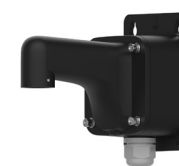
WALL MOUNT IR-V-BKX-WAL-02B