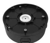
JUNCTION BOX IR-V-BKT-JB-02B