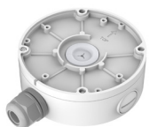
JUNCTION BOX IR-V-BKT-JB-02